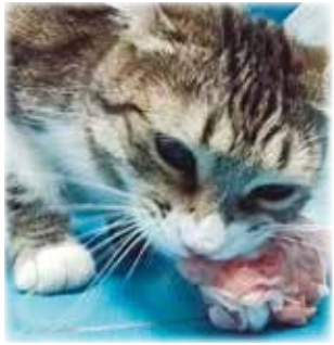
CHEWING ON A MUTTON BONE