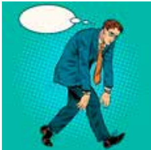
TO GIVE UP