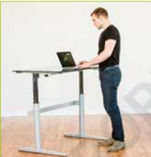
TO BE STANDING