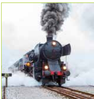
OLD STEAM TRAIN