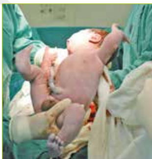
TO BE BORN