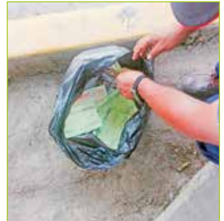
TO GET RID