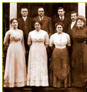
OLD FASHIONED CLOTHES